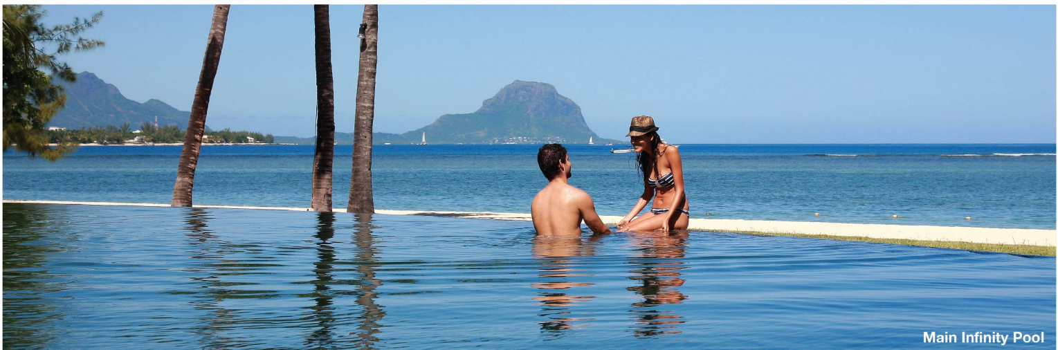
Main Infinity Pool

1 Bedroom villa 220 m 2 with a private pool of 25 m 2 Beachfront location. 2 adults & 2 extra bed child or teenager (up to 12 years old) and 1 baby cot or 3 adults.