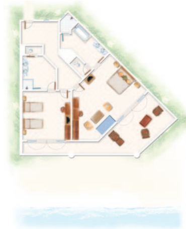
2-Bedroom Family Apartment