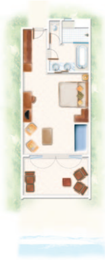
Superior Room First Floor