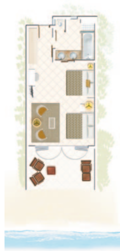
Deluxe Room / Deluxe Ground Floor