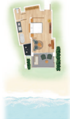
Ocean View Room