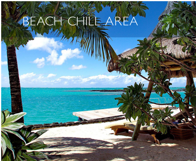
BEACH CHILL AREA