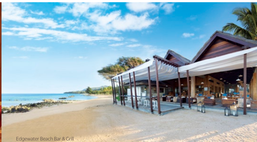
Edgewater Beach Bar & Grill