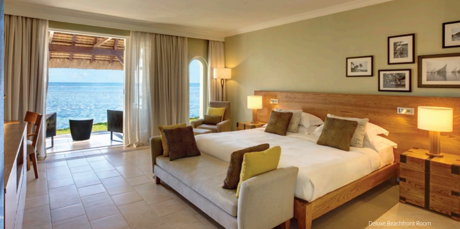
Deluxe Beachfront Room