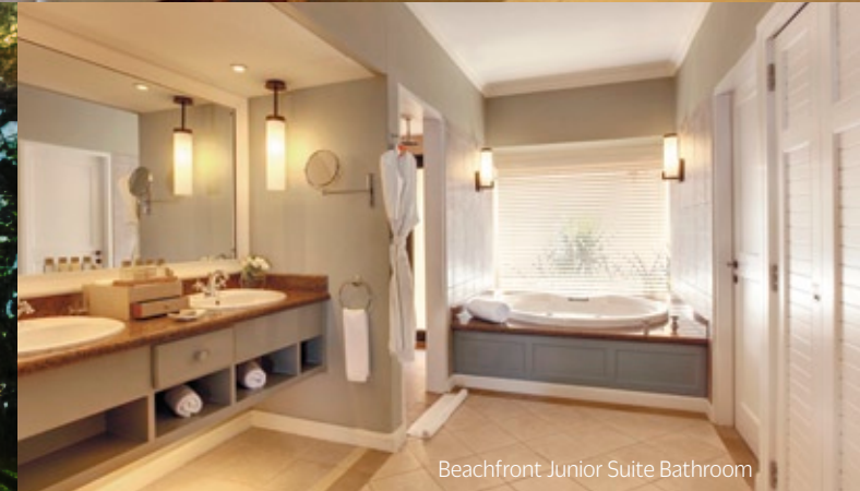
Beachfront Junior Suite Bathroom