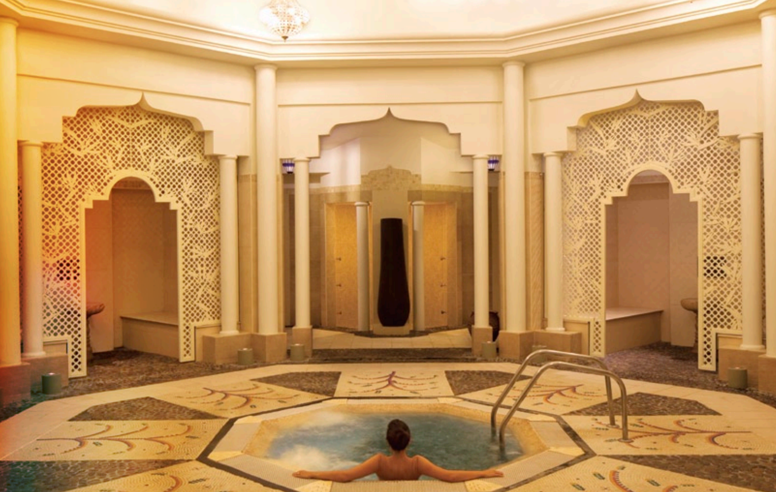
Navasana spa is a sanctuary of purity and well-being set in a Zen-inspired environment. A treatment at our spa is a voyage towards inner and outer beauty and serenity.