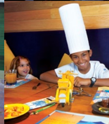
Outrigger Mauritius Beach Resort is an ideal destination for both couples and families alike.