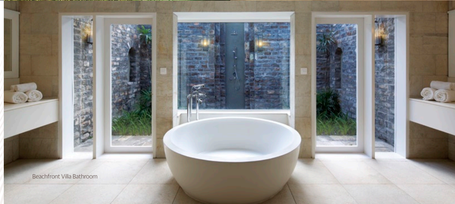
Beachfront Villa Bathroom

This exceptional Villa boasts a dining room, two deluxe suites with separate children's bedrooms, and two beach front rooms. Accommodates up to eight adults, four teenagers and two children under three years. 24-hour butler service is available upon request. Includes access to The Plantation Club facilities.