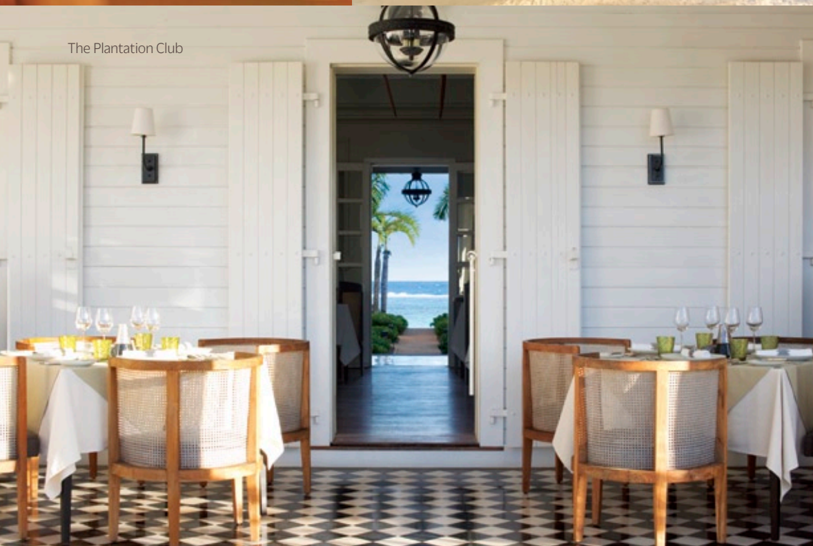
The Plantation Club