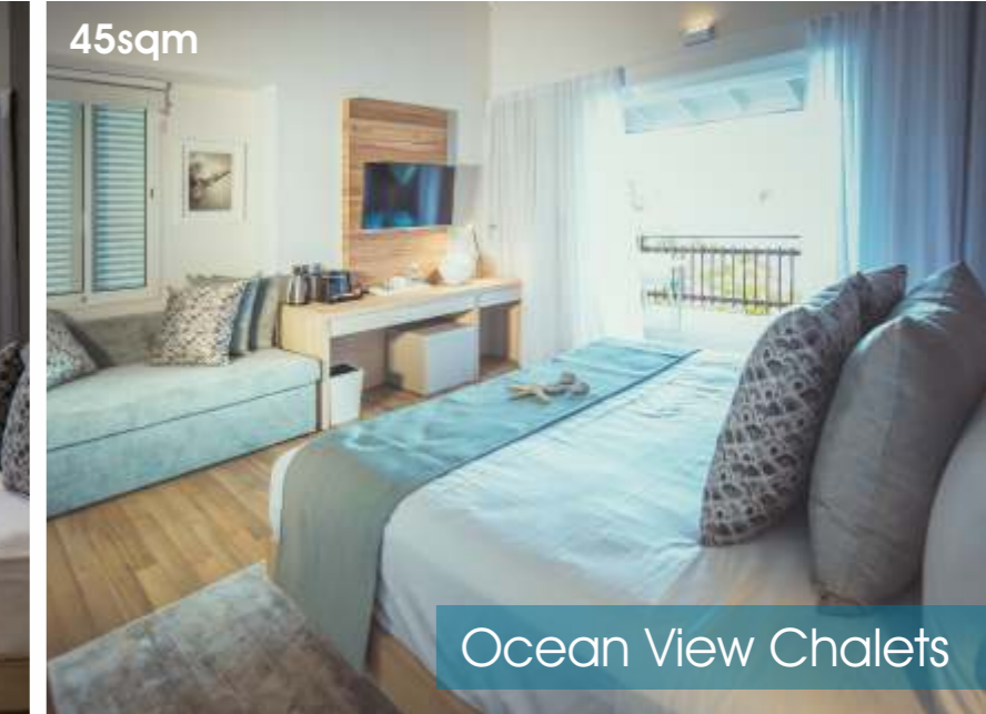
Ocean View Chalets