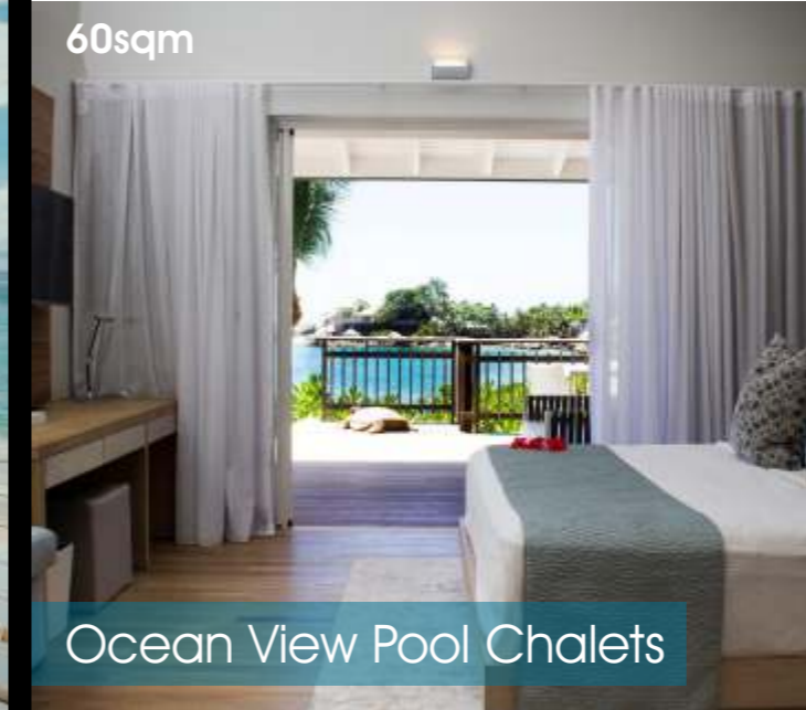
Ocean View Pool Chalets