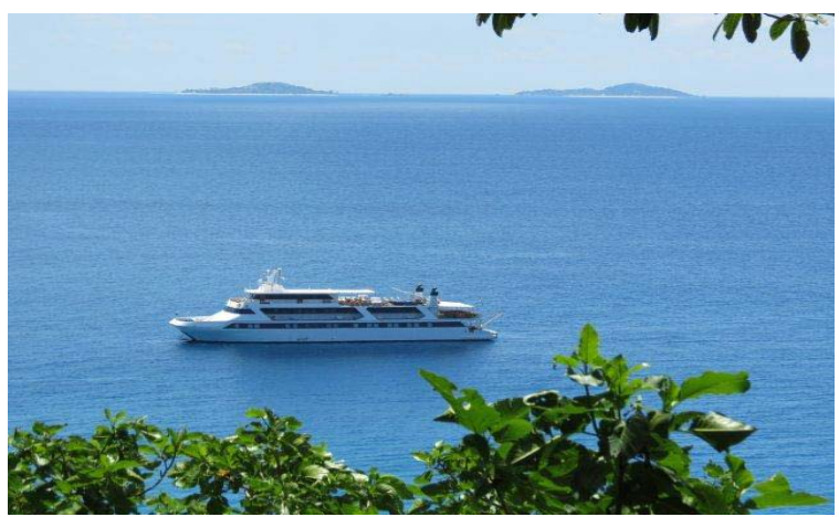
Discover Paradise in the Seychelles on board the Motor Yacht Pegasus