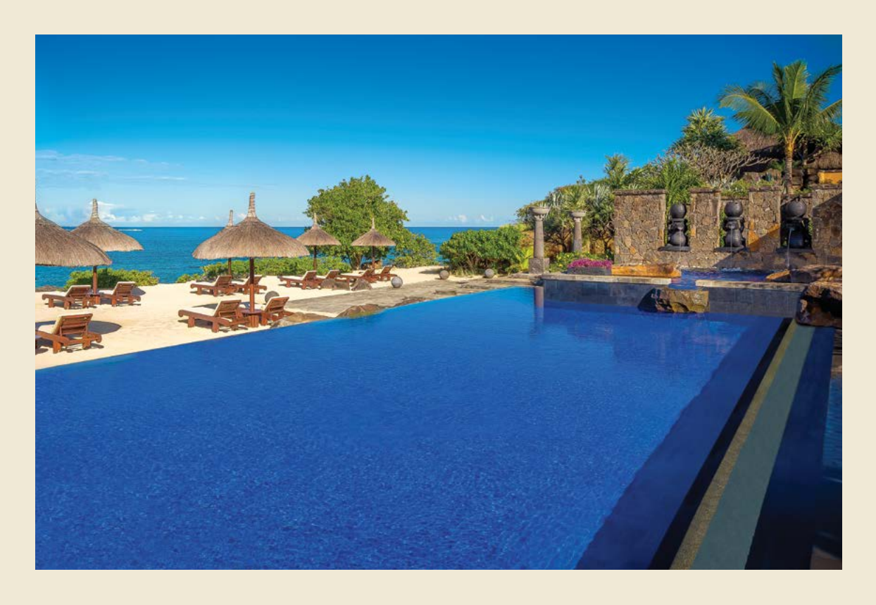
Turtle Bay Pool

The Turtle Bay swimming pool is located at the southern end of the resort and is a private and relaxing area complemented by a quaint bar offering a selection of alcoholic and non-alcoholic beverages.