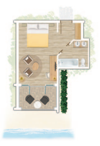
Standard Sea facing