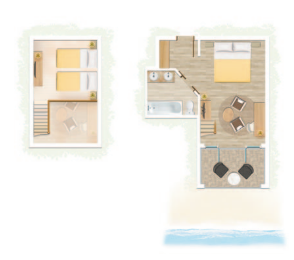
Family Duplex Garden / Family Duplex Sea facing