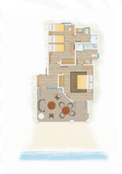
2-Bedroom Family Apartment