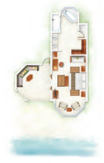
Junior Suite / Club Junior Suite / Club Junior Suite Beachfront / Zen Suite / Zen Suite Beachfront