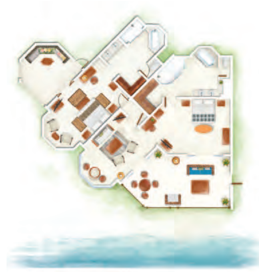
2-Bedroom Club Luxury Family Suite