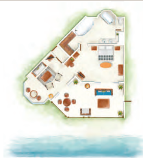
Club Senior Suite / Senior Zen Suite