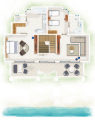
2-Bedroom Ocean Beachfront Family Suite