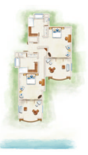
2-Bedroom Tropical Family Suite