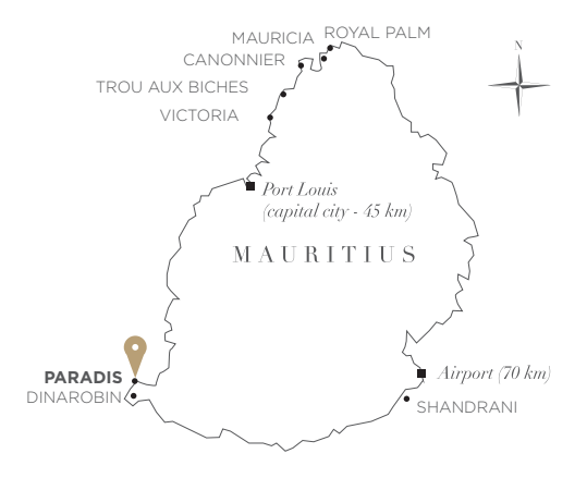
Distances Airport - 70 km Port Louis (capital city) - 45 km