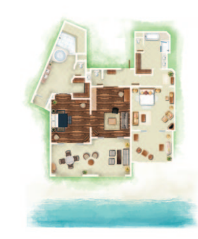
2-Bedroom Luxury Family Suite Beachfront