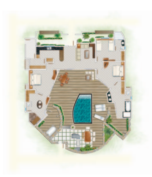
Pool Villa (3-bedroom)