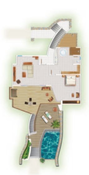
Beachfront Senior Suite with pool