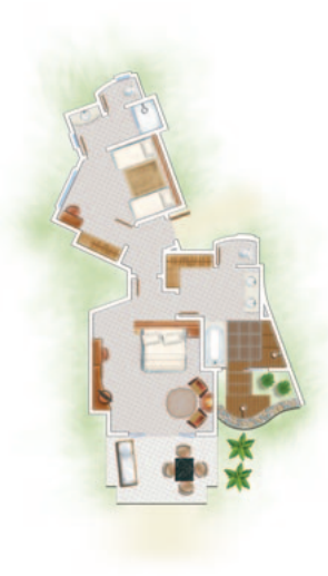
2-Bedroom Family Suite