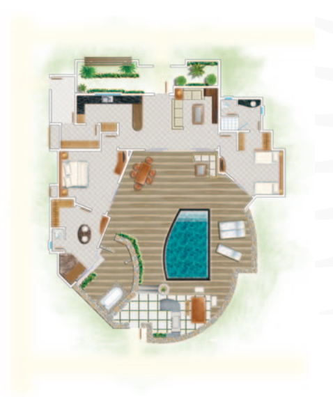
Pool Villa (2-bedroom)