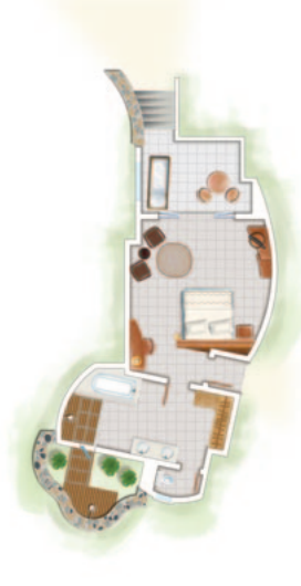
Tropical Junior Suite