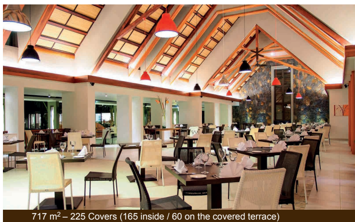
717 m 2 – 225 Covers (165 inside / 60 on the covered terrace)

Pamper your senses in our main restaurant with sumptuous buffets and "live cooking" stations. Theme evenings or table d'hôte menu.