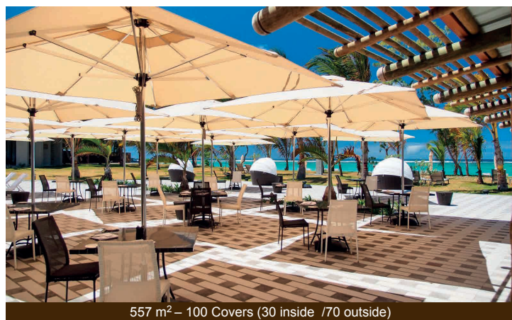
557 m 2 – 100 Covers (30 inside / 70 outside)

Located on the beach and surrounded by palm trees, the "à la carte" restaurant, open for lunch and dinner, offers a delicious selection of seafood and grilled dishes in a relaxed atmosphere.