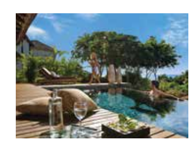
1 Maritim Villa / 160 m² Maximum occupancy: 6 persons Private pool