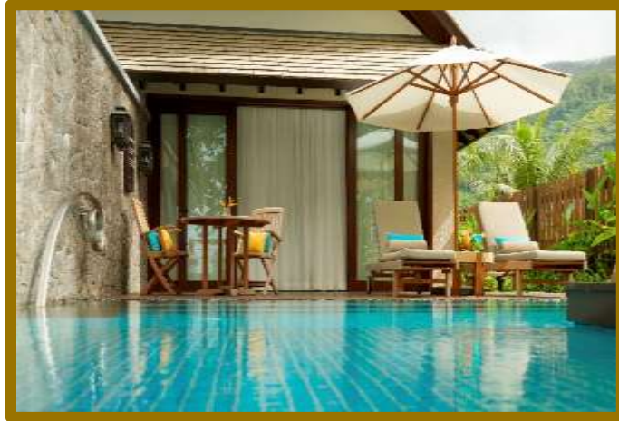
14 Beach Pool Villas (150 sqm)